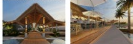
A Proposed Sea-View Restaurant