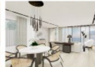
A Proposed Regatta Bay Villa - Dining Area