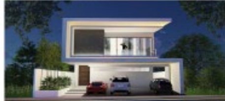
A Proposed Modern Contemporary Residence