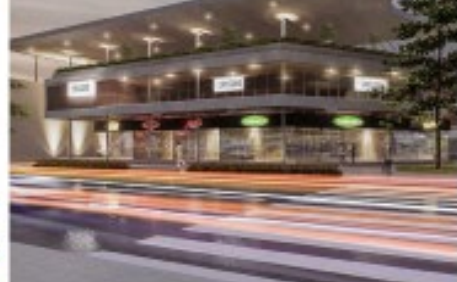
A Proposed Commercial Complex