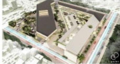
A Proposed Commercial Complex