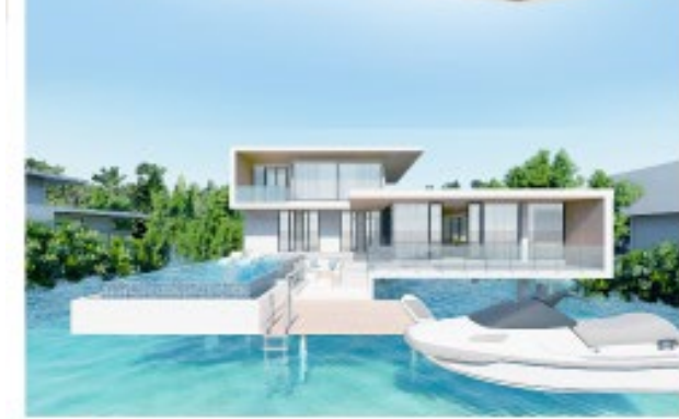
A Proposed Regatta Bay Villa