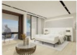
A Proposed Regatta Bay Villa - Master Bedroom