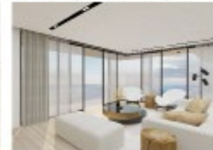
A Proposed Regatta Bay Villa - Living Area