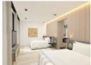
A Proposed Regatta Bay Villa - Bedroom